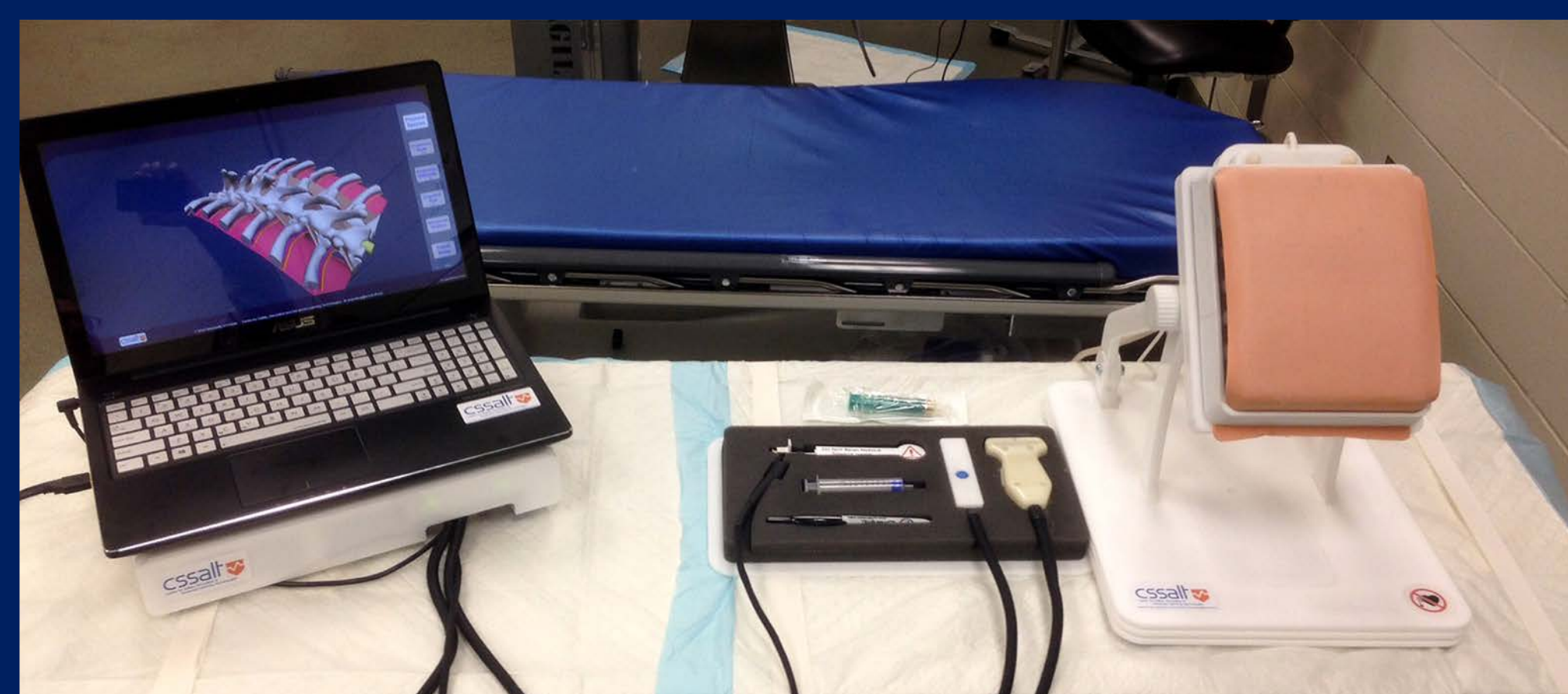
Fig 1. The mixed reality simulator

The main techniques for ultrasound (US)-guided thoracic paravertebral block (TPVB) are sagittal paramedian (SP) and transverse (T, lateral to medial). A goal of TPVB is to safely guide a needle tip into a thoracic paravertebral space without striking the lungs. In TPVB-SP 1 , a sharp needle insertion angle to avoid the transverse processes and an unfavorable insonation beam incidence angle to the lungs make the needle and lungs hard to acquire in an US image. For TPVB-T 2 , the needle and lungs are easier to acquire in an US image but the needle trajectory is towards the neuroforamen and risks spinal cord injury because needle advancement/catheter placement are towards the neuraxis. A technique where the needle and lung are readily acquired in an US image but without aiming a needle at the spine is therefore desirable. In addition, conventional US imaging of 3D anatomy generates 2D cross-sections, creating cross-sectional literacy issues for spatially-challenged users and novices and making it hard, even for experts, to fully appreciate the 3D anatomy as it relates to TPVB.